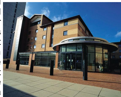
Manchester Conference Centre