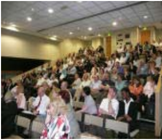
A cross section of delegates at the 2008 Joint ADA/DSTG Annual Conference